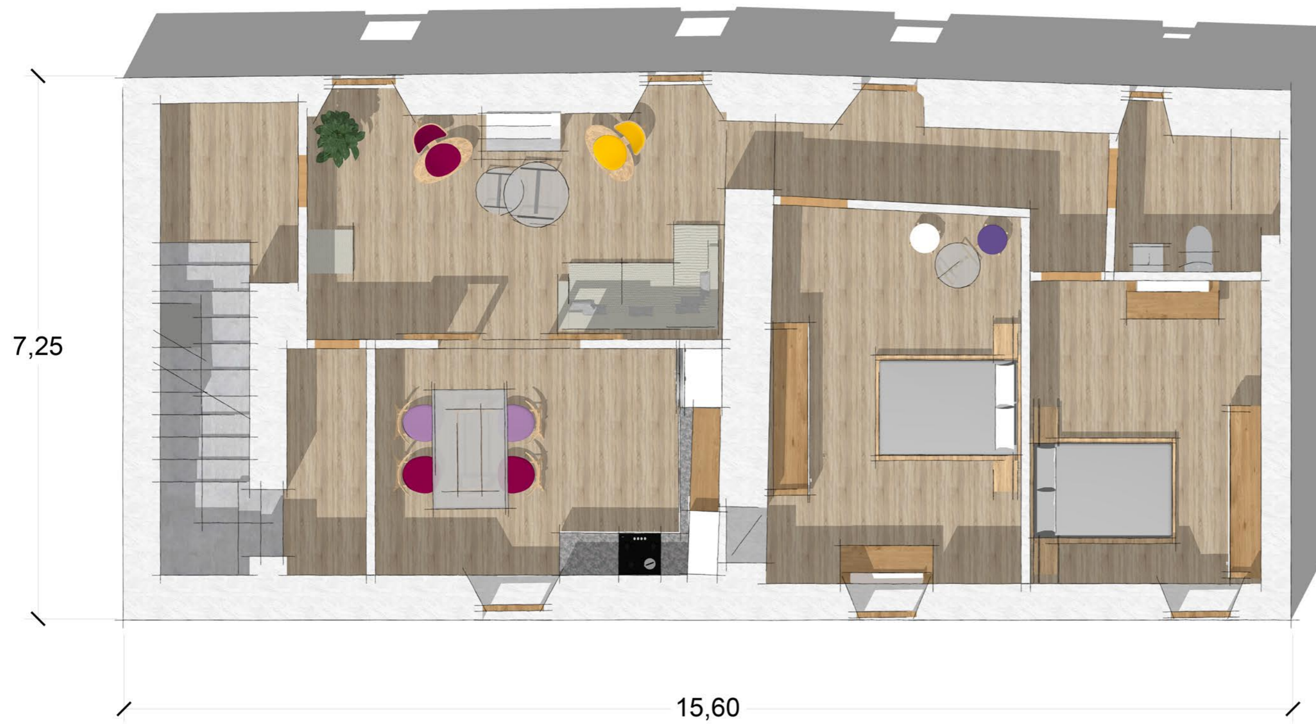
PIANO PRIMO SC 1:50 M2 LORDI 111.78